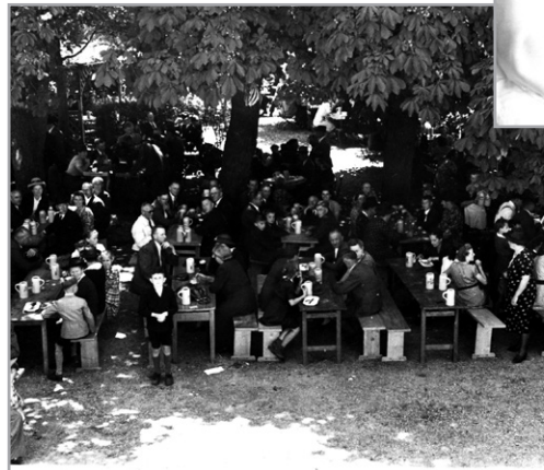
Beer garden 1930

The Hotel „Zur Mühle“ was opened in September 1982 and expanded in 1986. At that time also conference rooms and a wellness area had been established.