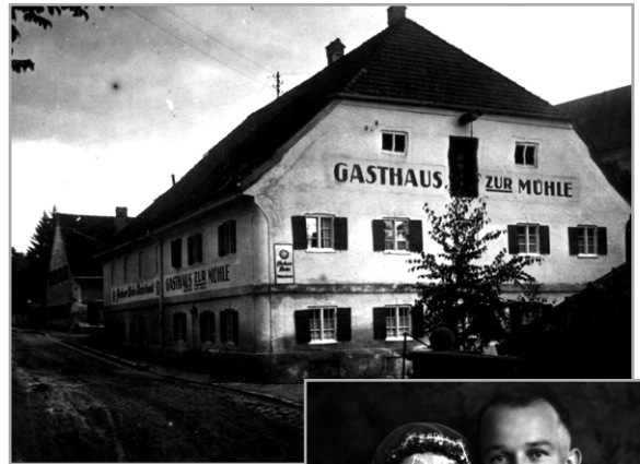
The Inn, about 1940