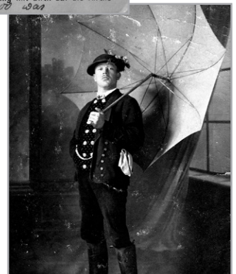
Anton Seidl acting at the rural folk theatre, about 1920